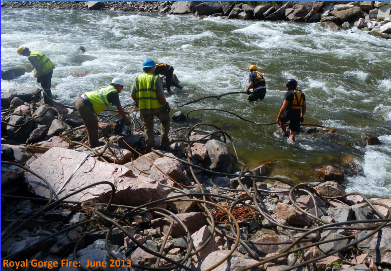
Royal Gorge Fire: June 2013