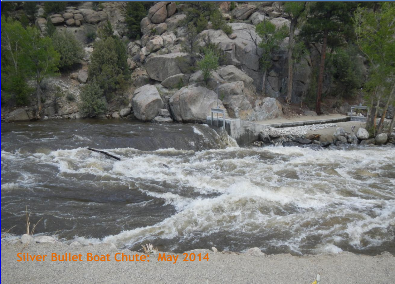
Silver Bullet Boat Chute: May 2014