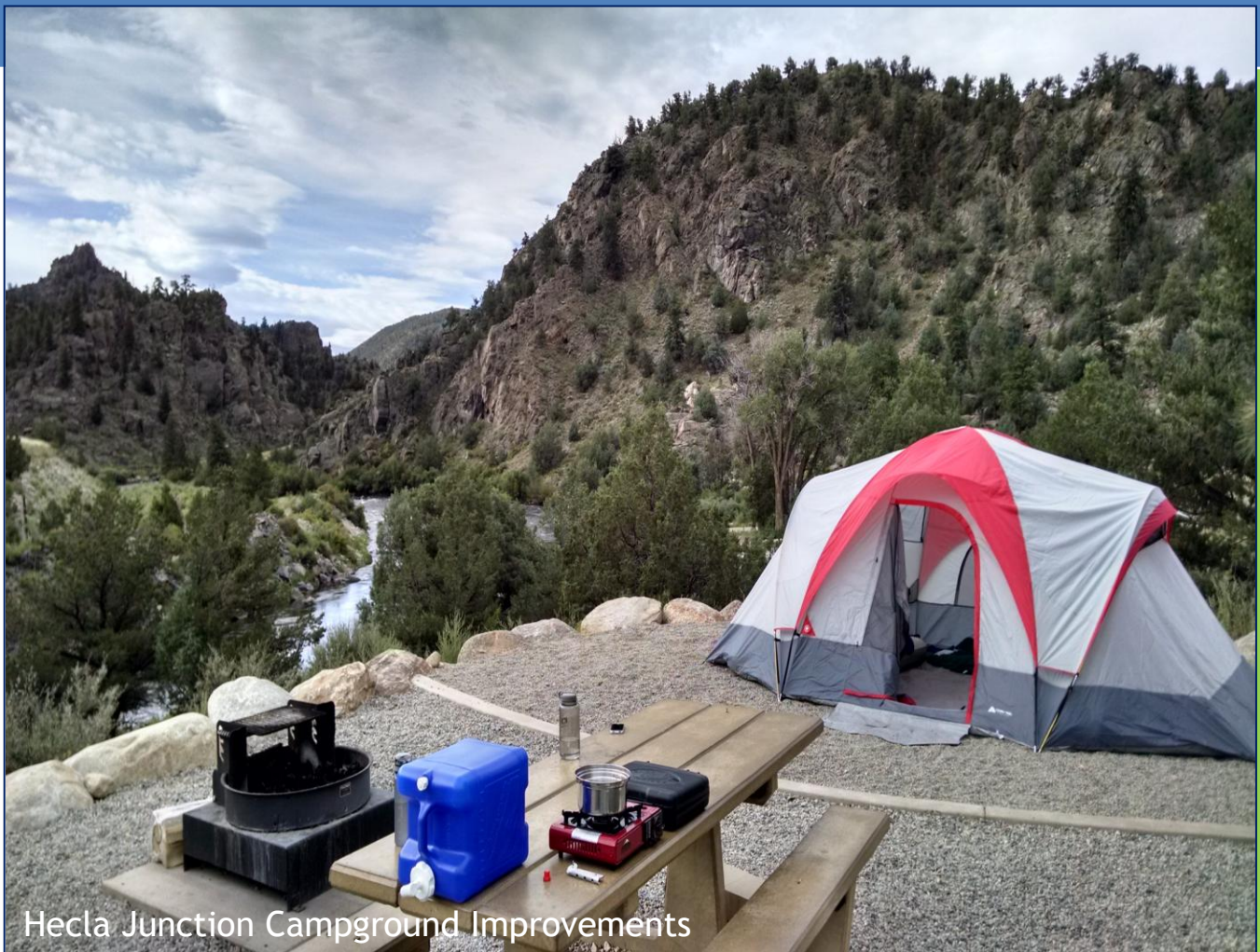
Hecla Junction Campground Improvements